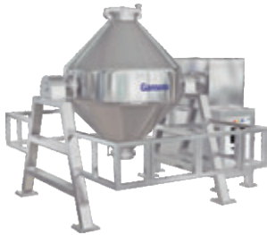
Double Cone Blender