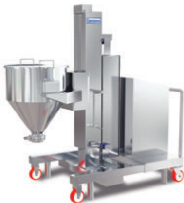
Lifting and Positioning Device