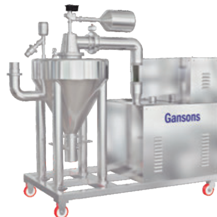
Vacuum Transfer System